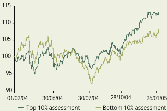
Figure 1: FTSEurofirst 300 (ex UK) – top/bottom 10% corporate governance assessment companies (indexed, one year)

Source: Deutsche Bank, 25 November 2005. Beyond the Numbers: Materiality of Corporate Governance