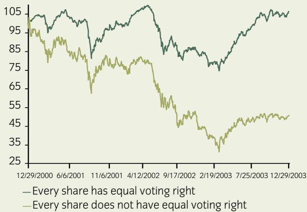
Figure 4: Companies with share with equal voting rights outperformed those with unequal voting rights