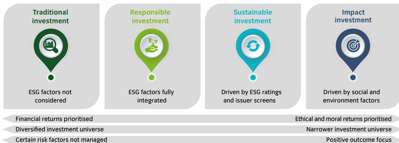
Figure 2: What does responsible investment mean in fixed income?

Finally, we note that clients and regulators increasingly require more transparency, and so we have prioritised offering clients reports on their portfolios' ESG performance, carbon footprint and impact on ESG issues.