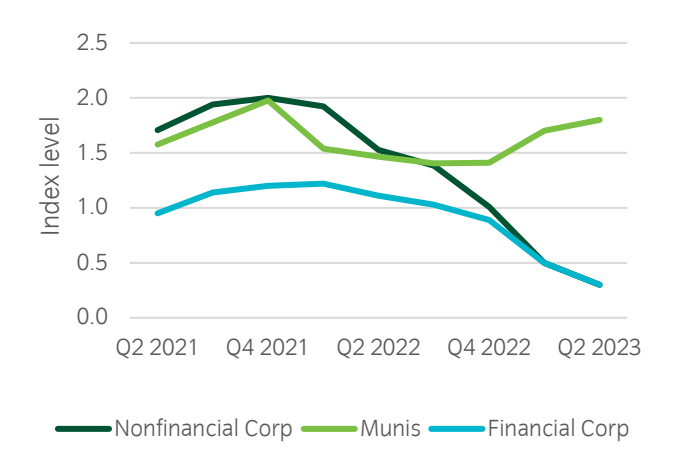
Figure 3: Munis are more resilient to current conditions than corporates<sup>5</sup>

Most US states set their 2024 financial year budgets very conservatively, with many building in forecasts of a mild recession over the year and committing to only very limited spending increases. With the economic backdrop proving more resilient than expected and given the replenishment of reserves over the last few years (see Figure 4), states should be very well positioned over the years ahead.