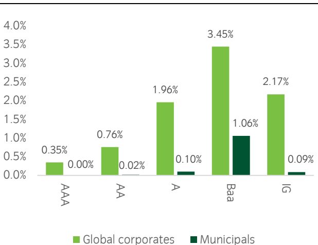
Figure 5: Historical default rates have been far lower for munis<sup>7</sup>

From 1970 to 2021, investment grade muni bonds experienced a cumulative default rate of only 0.09% versus 2.17% of IG global corporates within 10 years of issuance. In addition, munis have displayed a lower default rate for any given credit rating (see Figure 5). The ability for muni issuers to honor their debts to bond holders reflect the fact that many of these public corporations are virtual monopolies that deliver services with inelastic demand to the public.